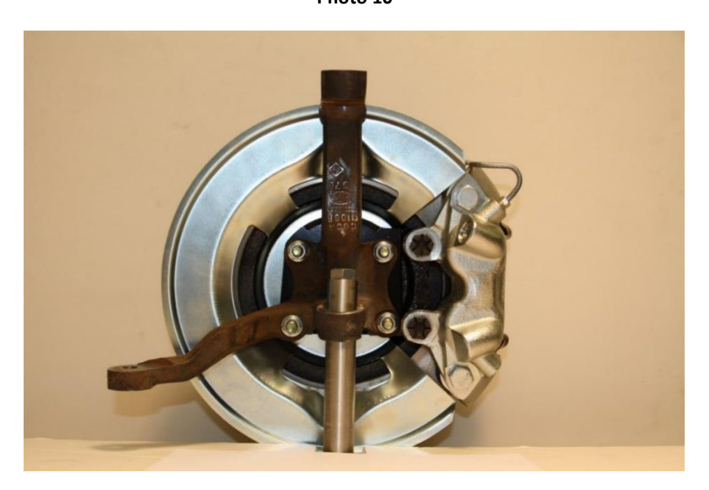
Front of car→