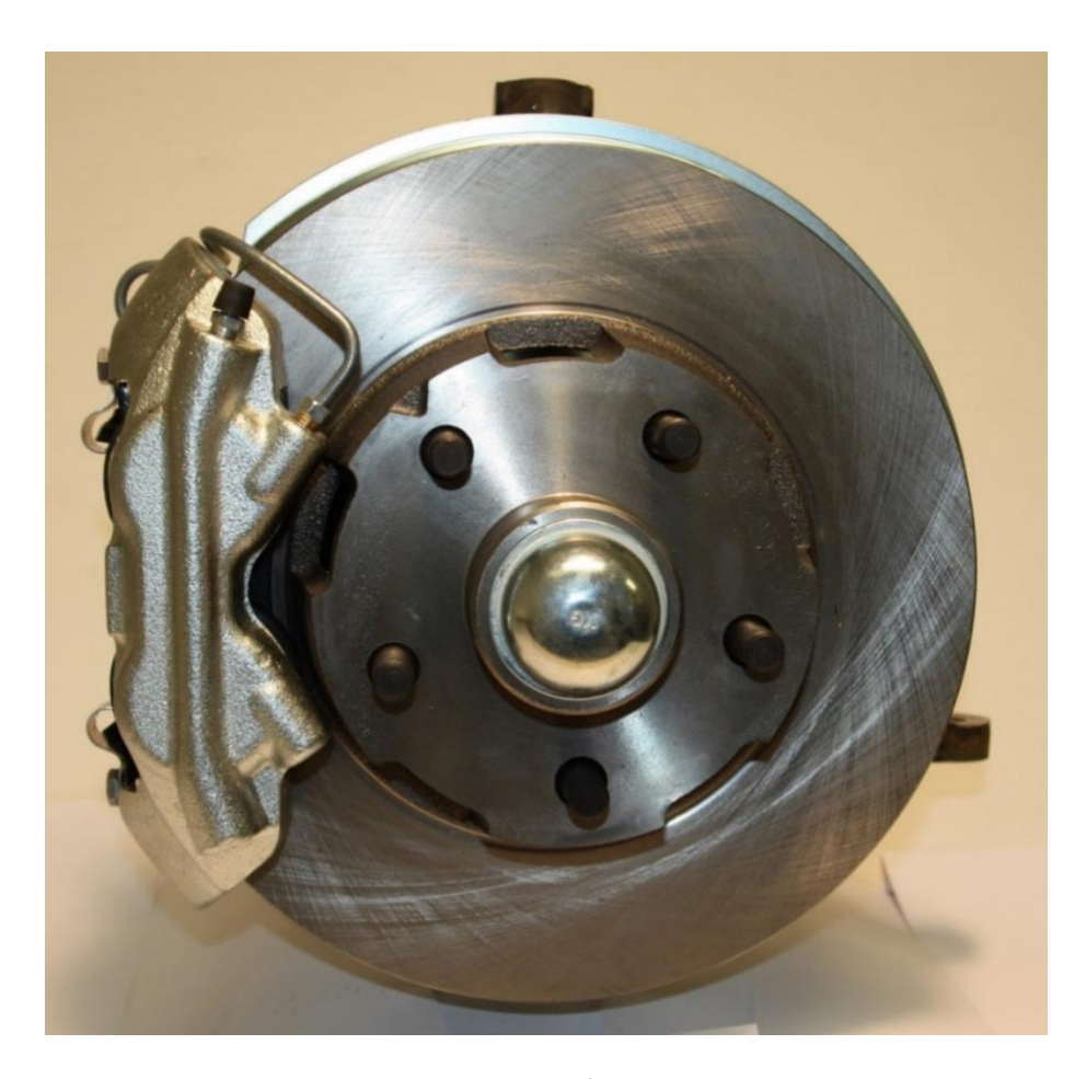
← Front of Car